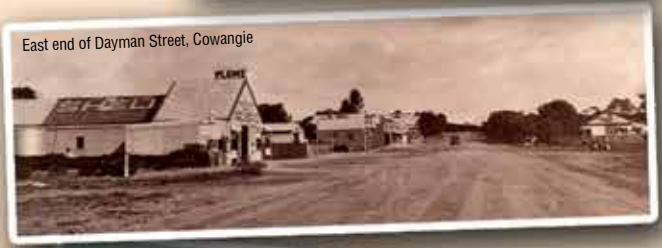
East end of Dayman Street, Cowangie