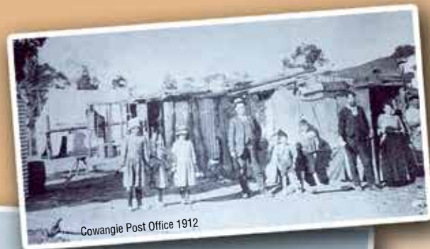
Cowangie Post Office 1912