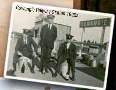
Cowangie Railway Station 1920s