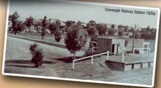
Cowangie Railway Station 1920s