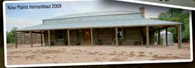
Kow Plains Homestead 2009