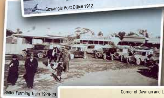
Better Farming Train 1928-29